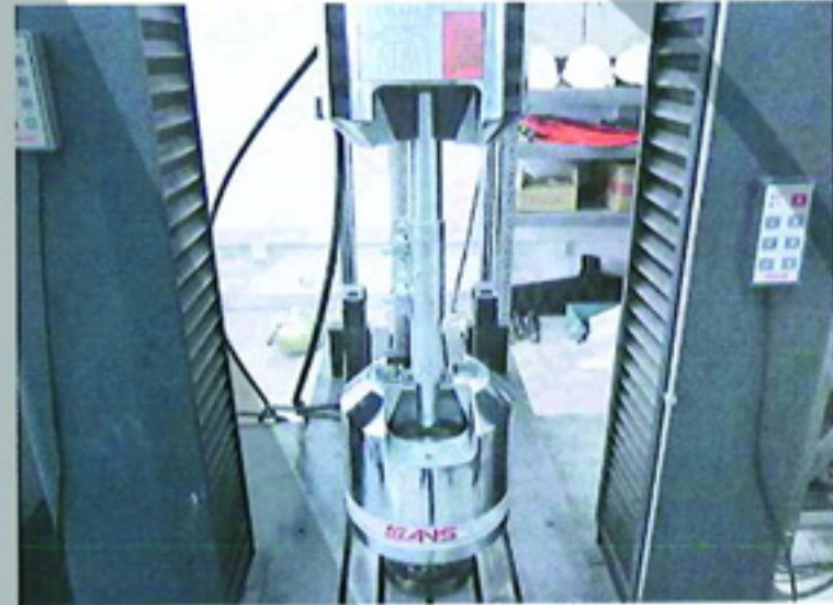
Test arrangement for slipping force test